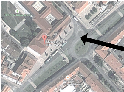
Museum near the cathedral (08:30) - Av. de Santa Joana Princesa