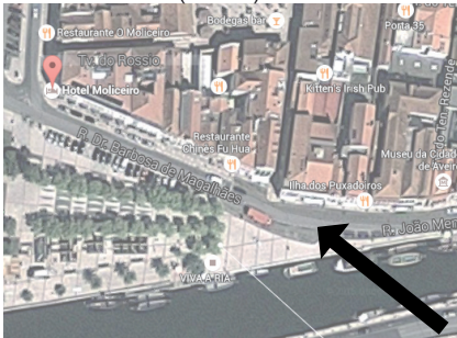
Near Moliceiro Hotel (08:40) - Rua João Mendonça